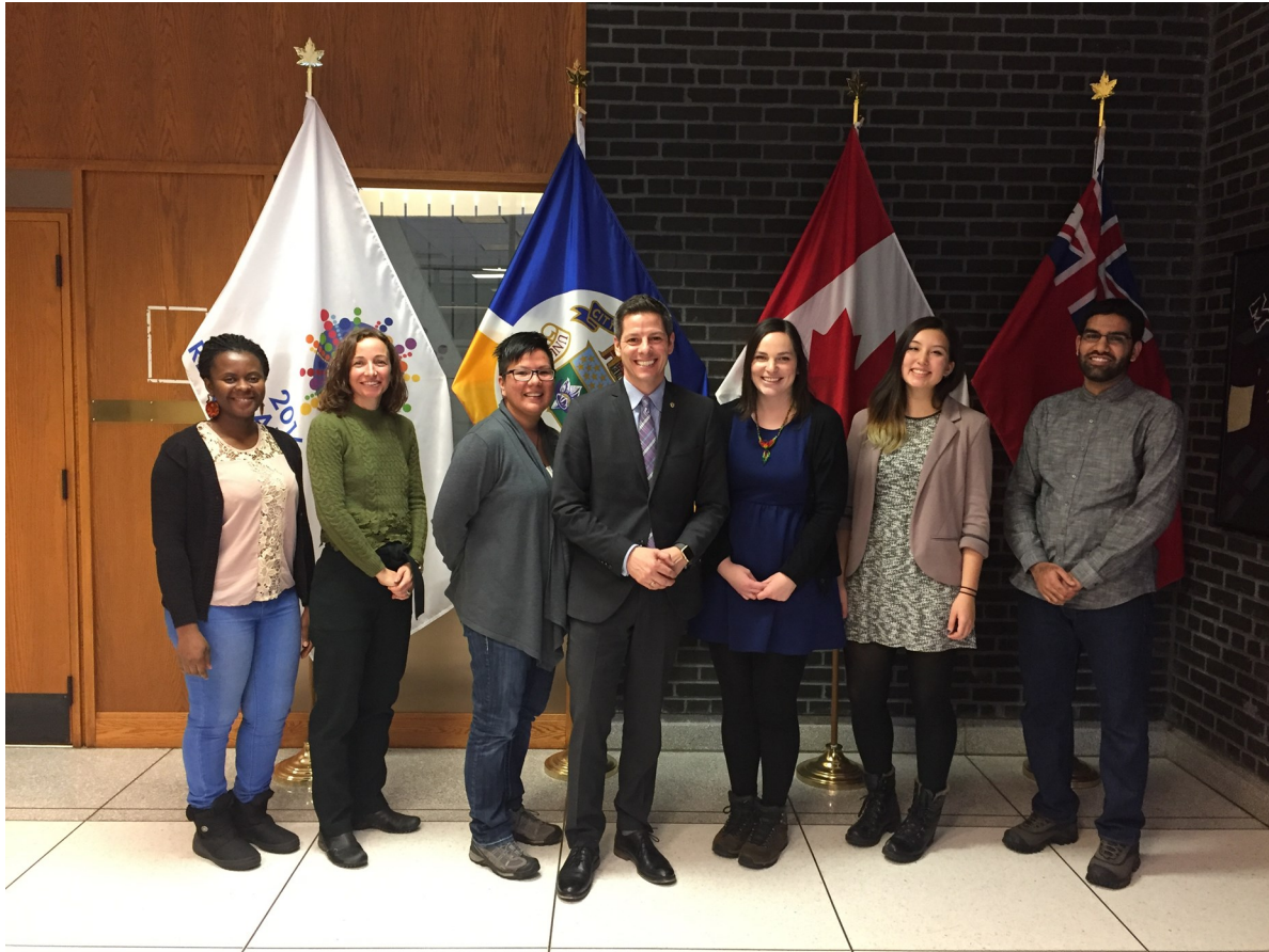
MDP Students presented their research on implementing the UN Declaration on the Rights of Indigenous Peoples at City Hall in December